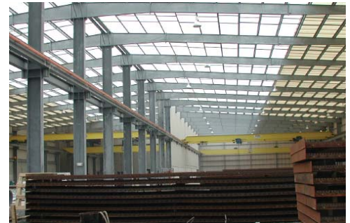
Tuff Span Roofing & Siding; Tuff Span Purlins over Pickling Line

To resist attack from aggressive chemical exposure, Tuff Span is formulated with premium resin systems, Iso-Polyester or Vinyl Ester. Extended and superior UV protection is provided by an exterior acrylic coating, UV stabilized resin, embossed resin-rich surface, and interior mat or veil. A wide range of profiles are available in opaque colors or translucent for natural light transmission.