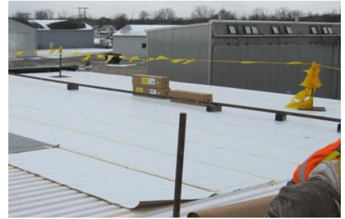
Corrosion resistant Tuff Span Roof Deck is a suitable substrate for either single-ply or built-up roofing.

The fiberglass reinforced plastic (FRP) decking delivers significant benefits for natoriums, paper mills, food processing plants, industrial facilities with chemical exposures and other challenging conditions.