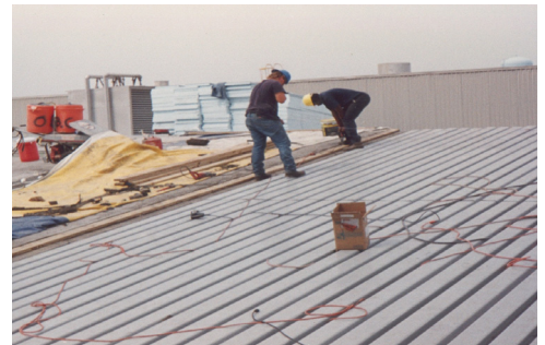
Mechanical fasteners, hot or cold adhesives can be used to attach roofing membrane and insulation.