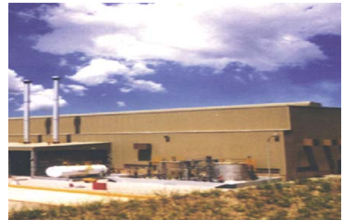
Tuff Span Roofing & Siding - 44,594 SM; Tuff Span Monitor Ridge Vent - 366 LM