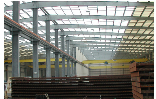
Tuff Span Roofing & Siding; Tuff Span Purlins over Pickling Line

To resist attack from aggressive chemical exposure, Tuff Span is formulated with premium resin systems, Iso-Polyester or Vinyl Ester. Extended and superior UV protection is provided by an exterior acrylic coating, UV stabilized resin, embossed resin-rich surface, and interior mat or veil. A wide range of profiles are available in opaque colors or translucent for natural light transmission.