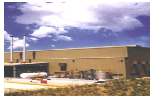
Tuff Span Roofing & Siding - 480,000 SF; Tuff Span Monitor Ridge Vent - 1,200 LF